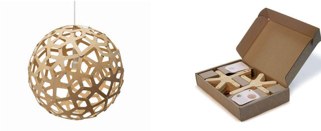
Figure 8: Coral Pendant Light

[Sources: Coral Pendant with Seed System Kitset Packaging ( www.davidtrubridge.com )]