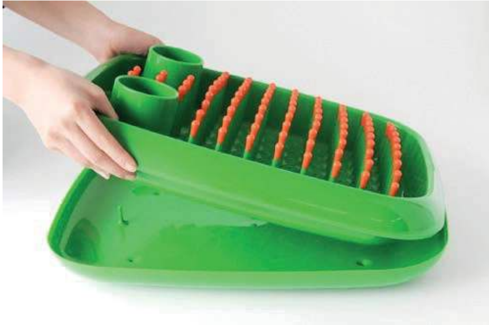
Figure 3a: Dish Doctor showing two injection moulded parts

[Source: DISH DOCTOR designed by Marc Newson for MAGIS, 1997]