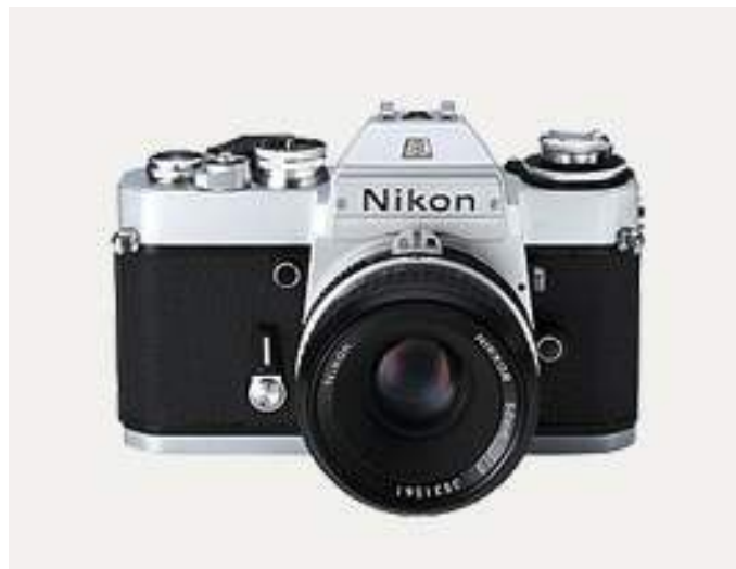
Figure 5: Nikon EL2 (1977)