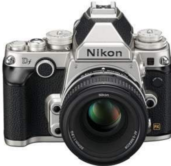
Figure 4: Nikon DF (2013)