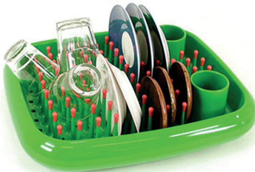
Figure 3b: Dish Doctor in use

[Source: DISH DOCTOR designed by Marc Newson for MAGIS, 1997]